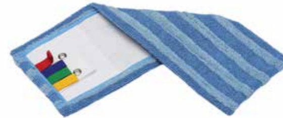
M1.5001 Microfiber Flat Mop POCKET-TAB Polyester backing, with pockets and colour-coded tag, Mainly used for the wet mopping of medium/high dirty interior floors (in hotels, houses, offices, hospitals, etc).