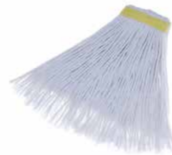
Rayon Cut End Wet Mop