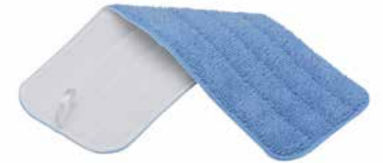
M1.2001 Microfiber Wet Mop Pad 80/20 blend. Velcro Backing. Foam insert for improved absorbency. Excellent launderability, Available in four colors for coding systems: red, yellow, green and blue.