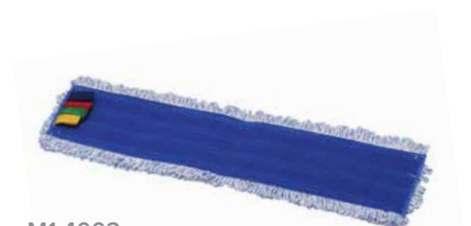
M1.4002 Microfiber Looped Damp Pad 80/20 yarn blend – twisted weave loop Polyester hook velcro, polyester pocket or polyester 3-pin tab style backing. Premium pickup of dust load. Green and white or blue and white stripped – twisted loops Lengths: 9, 16 1/2" or 18".