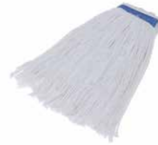
WHITE - 1" Blended Cotton Cut End