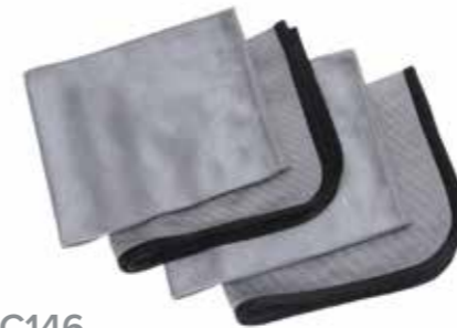
GMC146 Glass Cloth

EDGELESS All-Purpose Terry Microfiber Towel with ultrasonic cutting edge. Microfiber hi-low pile. Thick and large. Extremely Durable . 40x40CM' - 300 GSM