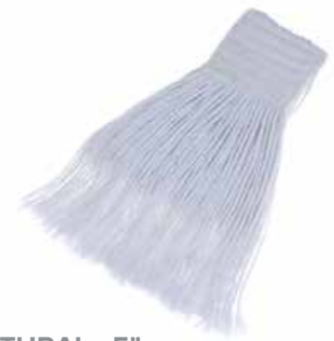
NATURAL - 5" Rayon Cut End Wet Mop