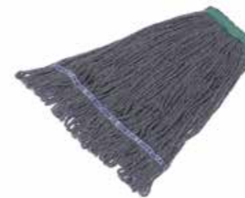
GREY - 1" Blended Looped End Wet Mop