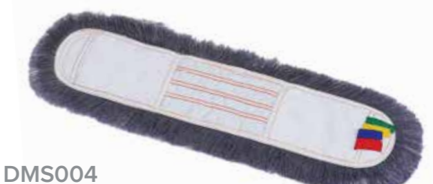
DMS004 Dust Mop Acrylic

Acrylic Dust Mop with Blue polyester canvas back. Sweeps up fine dust. For dry mopping large surfaces.. The mop heads are available in a range of sizes for efficient and effective dust control.