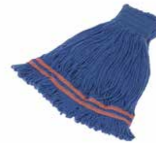
BLUE - 1" Blended Looped End Wet Mop