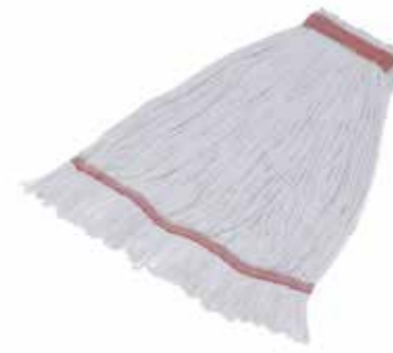
WHITE - 1" Blended Looped End Wet Mop