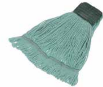
GREEN - 1" Blended Looped End Wet Mop