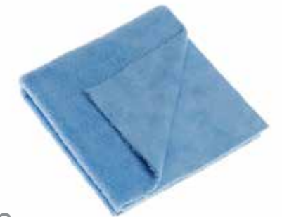
EMC143 Edgeless Cloth

Lint-free, non-abrasive & absorbent Safe on most surfaces & effectively removes dirt & dust with or without chemicals Use damp for cleaning, wet for heavily soiled areas and dry for dust Thick and large 40 x 40CM 300GSM