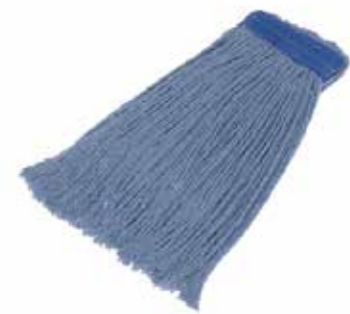
BLUE - 5" Blended Cotton Cut End