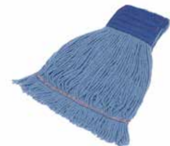
BLUE - 5" Blended Looped End Wet Mop