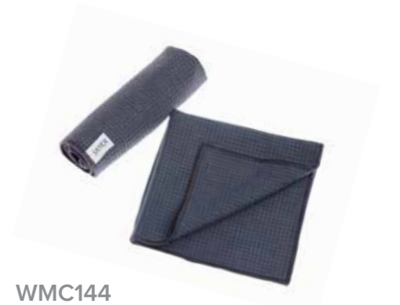
WMC144 Waffle Weave Cloth

80% Polyester; 20% Polyamide. 30X30CM & 40X40CM. 200GSM to 350GSM. Machine washable: up-to 500 times Available in multiple colors for color coding by area or application.