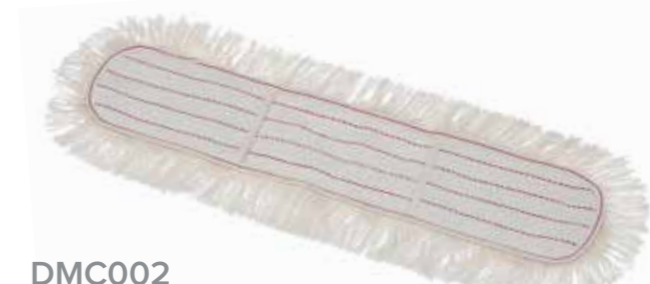
DMC002 100% Cotton Dust Mop

Acrylic Dust Mop with cotton canvas back. Sweeps up fine dust. For dry mopping large surfaces.. The mop heads are available in a range of sizes for efficient and effective dust control.