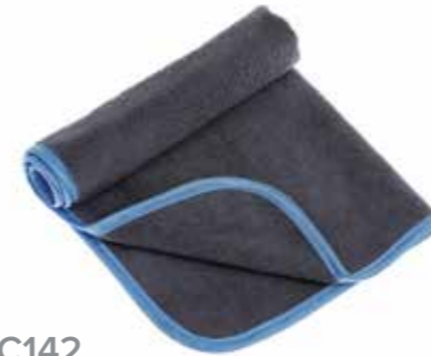
BMC142 Binding Edge Cloth

Waffle" Microfibre cloths have a textured finish which is more abrasive than traditional cloths. Absorbs Up To 10 times Its Weight in Moisture. Effective for the Removal of Dust and Dirt Without the Use of Chemicals. 40x40 cm - 360 GSM