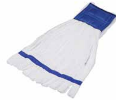
M1.1001 Microfiber Tube Wet Mop Excellent for general-purpose mopping. Extremely absorbant, textured finish loosens and holds dirt until washed. 5' Wide mesh headbands and tailbands are longer lasting and come in a variety of colors for coding.