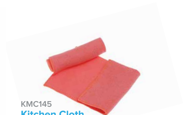
KMC145 Kitchen Cloth

Shiny Microfiber Glass Cloth with binding edge : Lint Free Microfiber Glass Cleaning Cloths, Effective for the Removal of Dust and Dirt Without the Use of Chemicals. 40x40 cm approx - 300 GSM