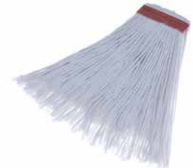
Rayon Cut End Wet Mop