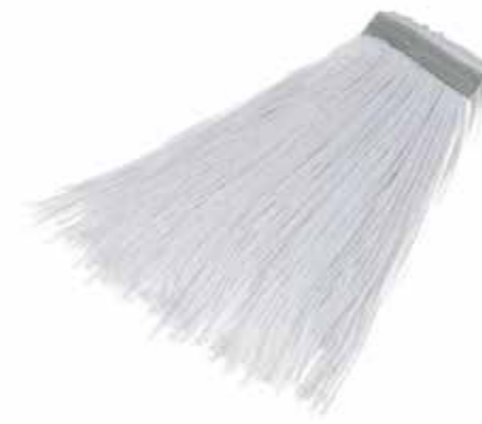
WHITE - 1" Rayon Cut End Wet Mop