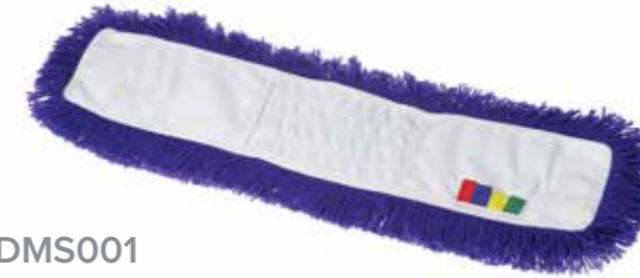
DMS001 Dust Mop Acrylic

Acrylic Dust Mop with polyester back and colour coded tags. Sweeps up fine dust. For dry mopping large surfaces.. The mop heads are available in a range of sizes for efficient and effective dust control.