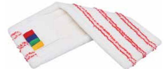
M1.5002 Microfiber Flat Mop POCKET-TAB German Designed and engineered. white microfiber mop with blue & red stripes and abrasive, polyester backing, pockets and colour-coded tags. Ideal for dusting, wet mopping and disinfection.