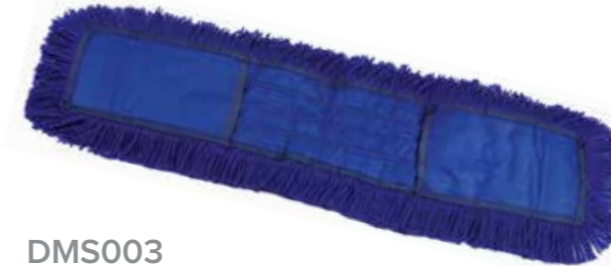
DMS003 Dust Mop Acrylic

Acrylic Dust Mop with cotton canvas back. Sweeps up fine dust. For dry mopping large surfaces.. The mop heads are available in a range of sizes for efficient and effective dust control.