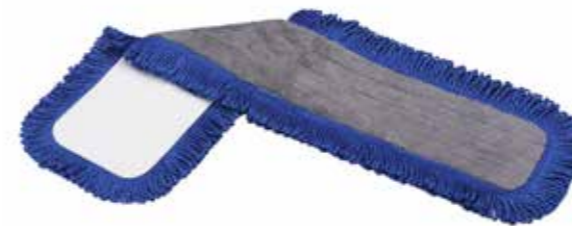
M1.4001 Microfiber Fringed Velcro Dust Mop Our Velcro Dust mop pad provide a simple, lightweight, superior cleaning experience. The mops can be used on any hard surface and leave no streaks or residue. 6.5" Wide backing. Available in 18", 24" and 36" lengths. Launderable up to 500 times.