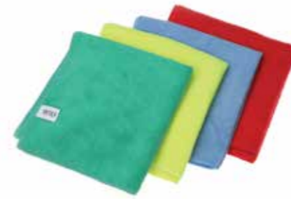
UMC140 Multi Purpose Cloth

80% Polyester; 20% Polyamide. 30X30CM & 40X40CM. 200GSM to 350GSM. Machine washable: up-to 500 times Available in multiple colors for color coding by area or application.