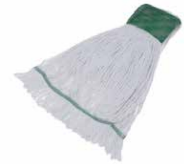
WHITE - 5" Blended Looped End Wet Mop