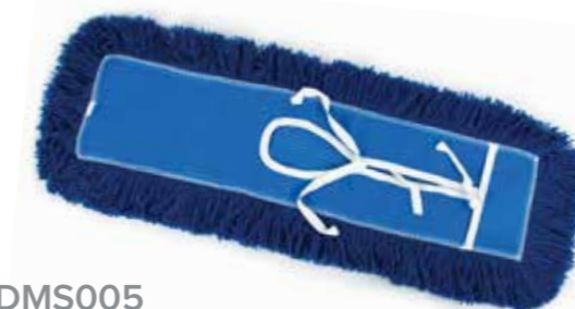
DMS005 Dust Mop Acrylic

Acrylic Dust Mop Grey with polyester canvas back with colour coded tags. Sweeps up fine dust. For dry mopping large surfaces.. The mop heads are available in a range of sizes for efficient and effective dust control.