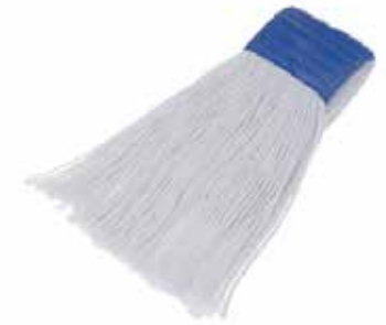
NATURAL - 5" Cotton Cut End Wet Mop - Natural -5"