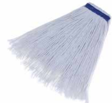
Rayon Cut End Wet Mop