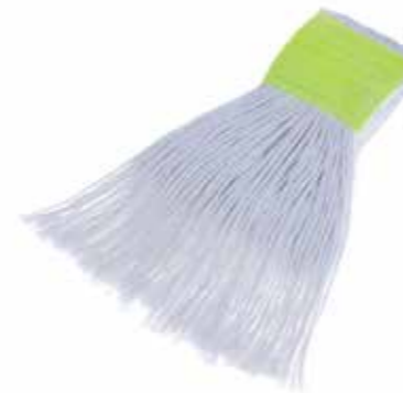
Rayon Cut End Wet Mop