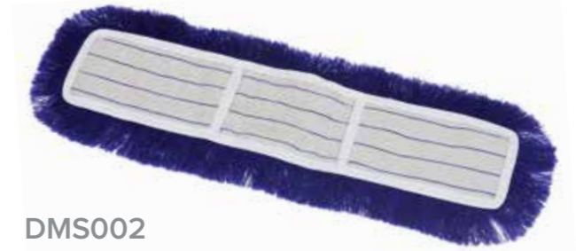
DMS002 Dust Mop Acrylic

Acrylic Dust Mop with polyester back and colour coded tags. Sweeps up fine dust. For dry mopping large surfaces.. The mop heads are available in a range of sizes for efficient and effective dust control.